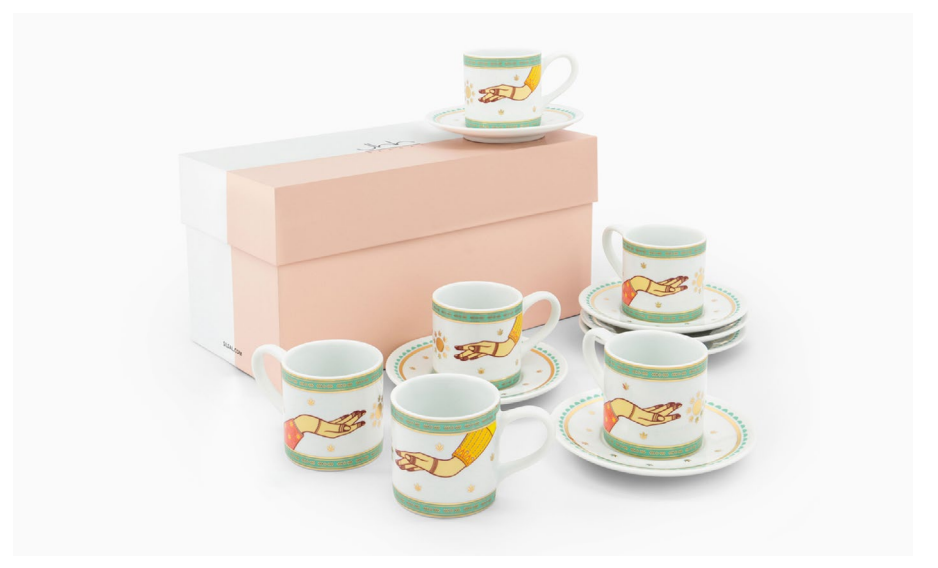
Set of 6 Espresso Cups AED 659