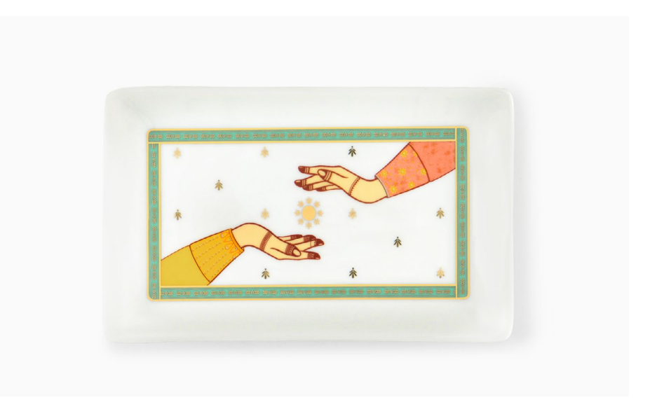
Catchall Tray AED 89