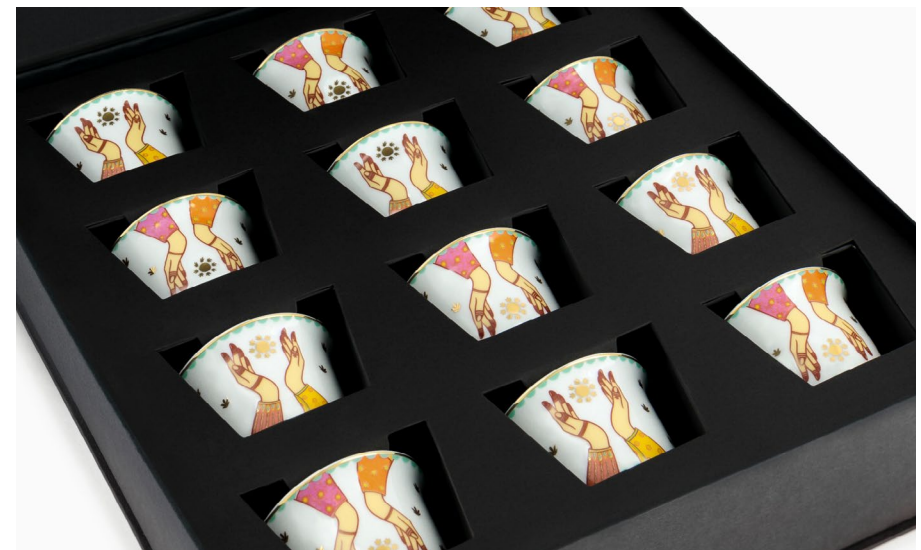
Set of 12 Arabic Coffee Cups AED 756