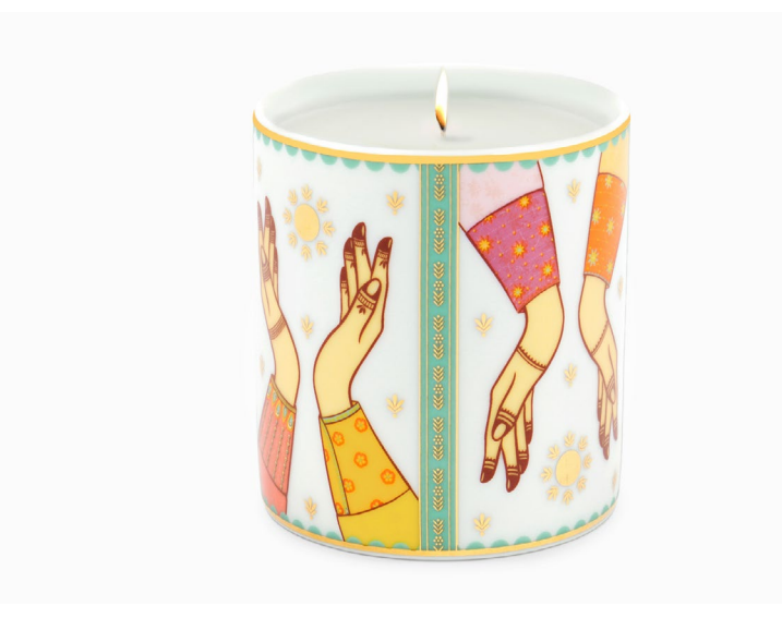
Rose & Oud Candle AED 179