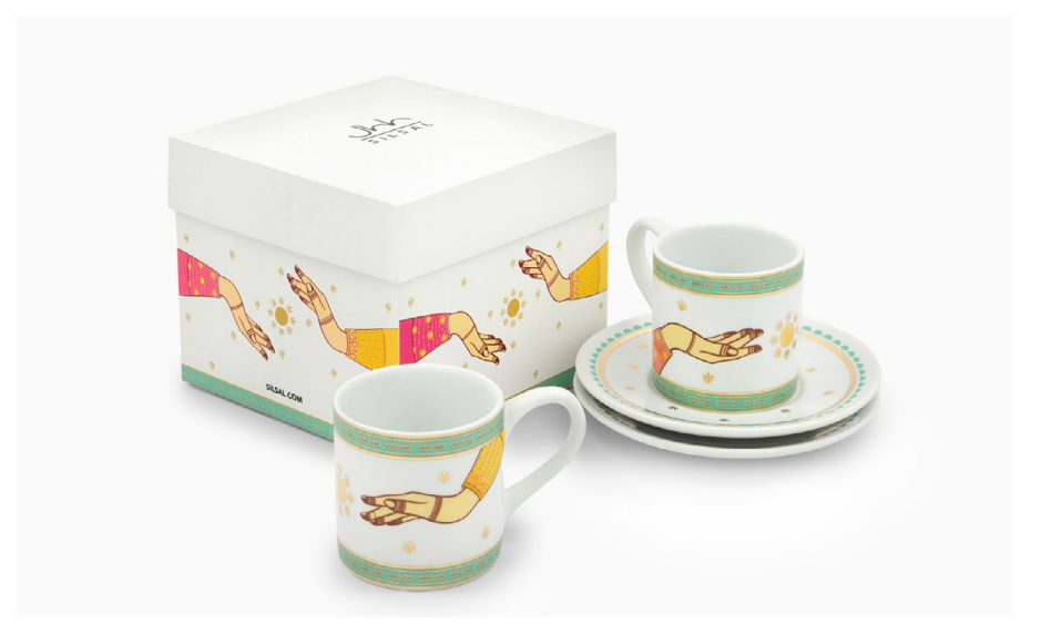
Set of 2 Espresso Cups AED 229