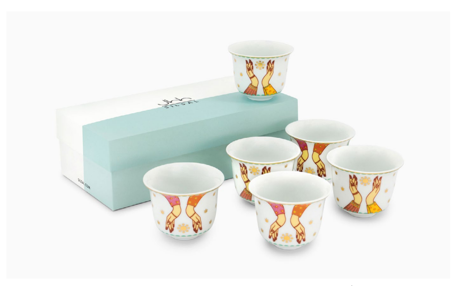
Set of 6 Arabic Coffee Cups AED 378

Henna designs are a form of self-expression and can be customized to reflect an individual's personality or preferences.