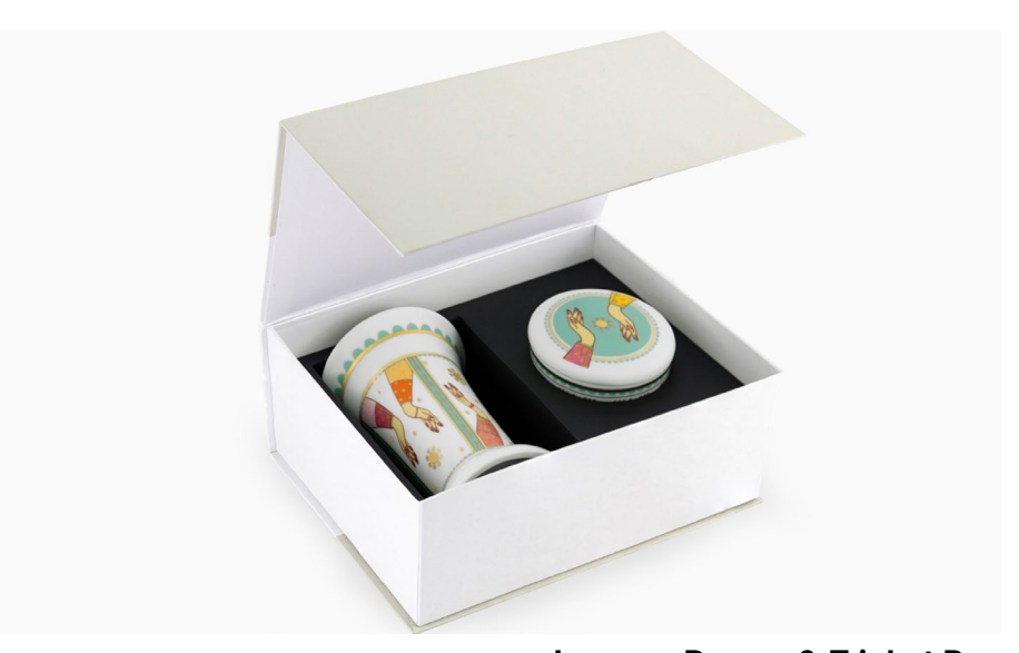
Incense Burner & Trinket Box AED 424