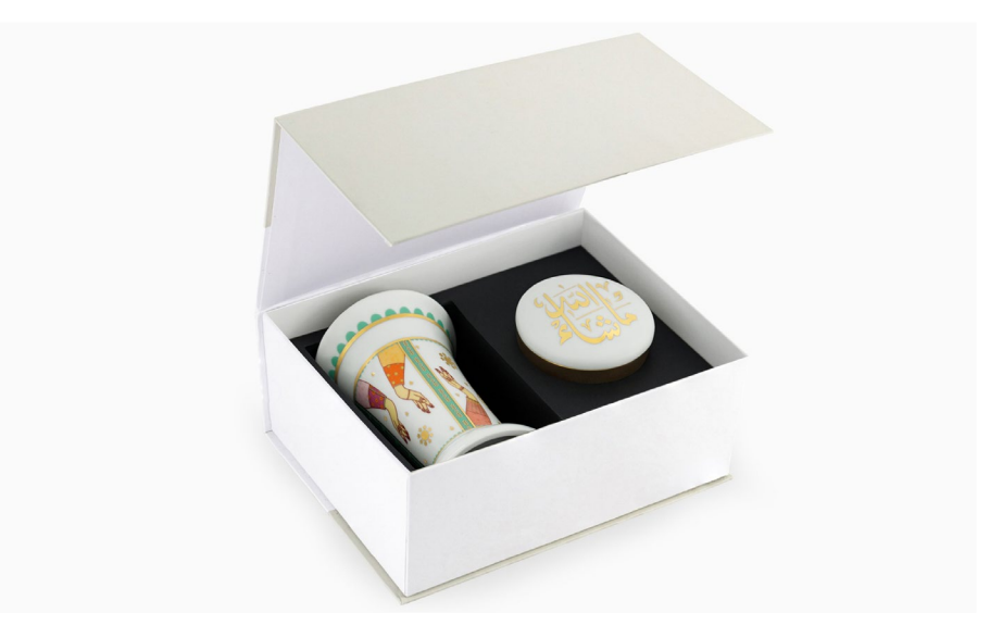
Incense Burner & Trinket Box AED 424