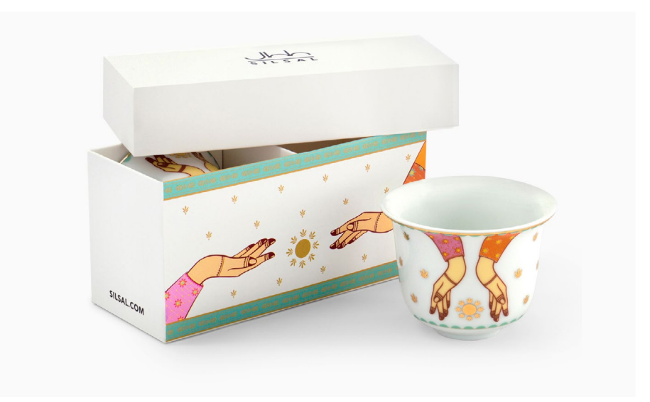
Set of 2 Arabic Coffee Cups AED 126