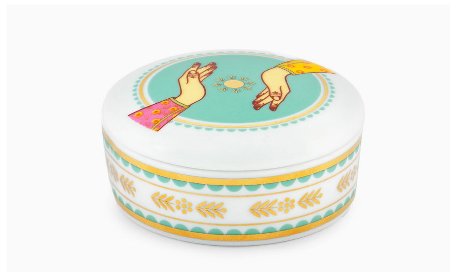
Trinket Pot AED 99