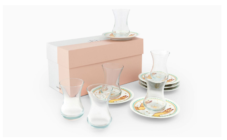
Set of 6 Teacups AED 547