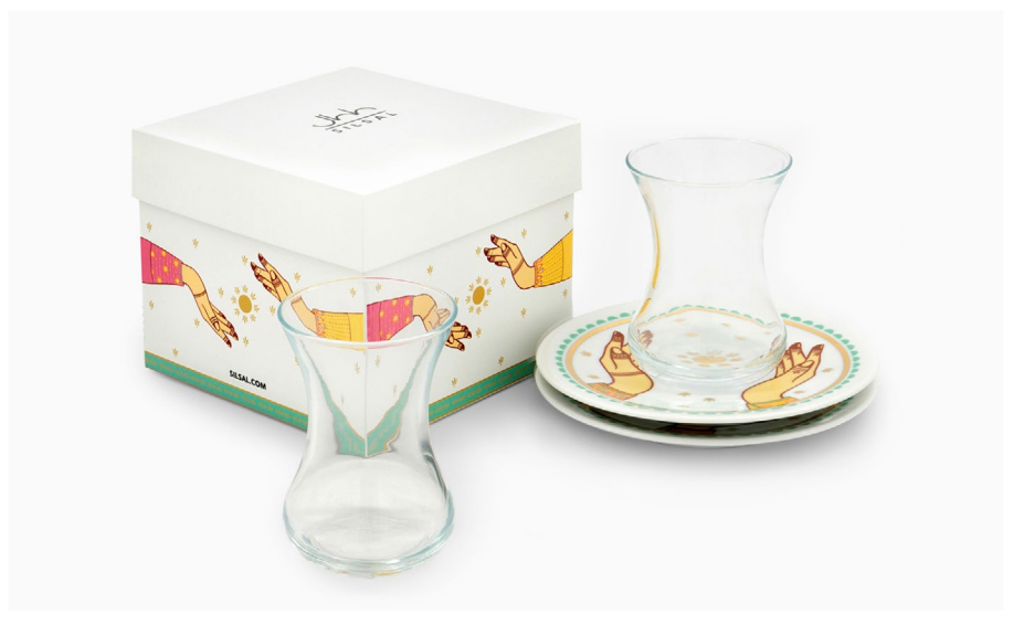
Set of 2 Teacups AED 189