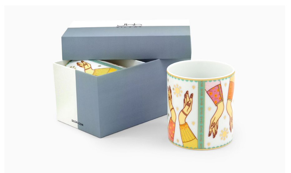
Set of 2 Green Teacups AED 169

In addition to its aesthetic appeal, Henna is known for its cooling properties and is used to soothe and nourish the skin. It is a natural alternative to permanent tattoos, as it is temporary and fades over time.