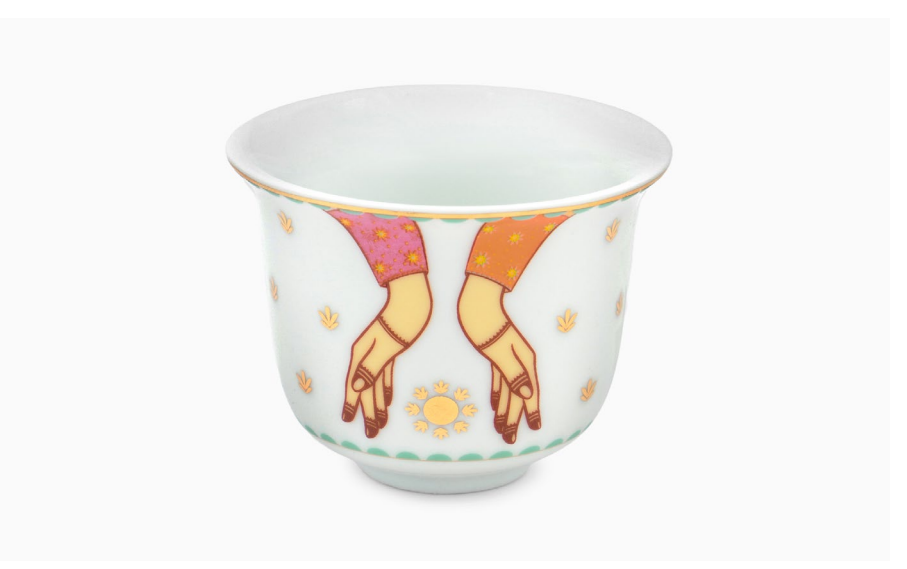
Arabic Coffee Cup AED 63